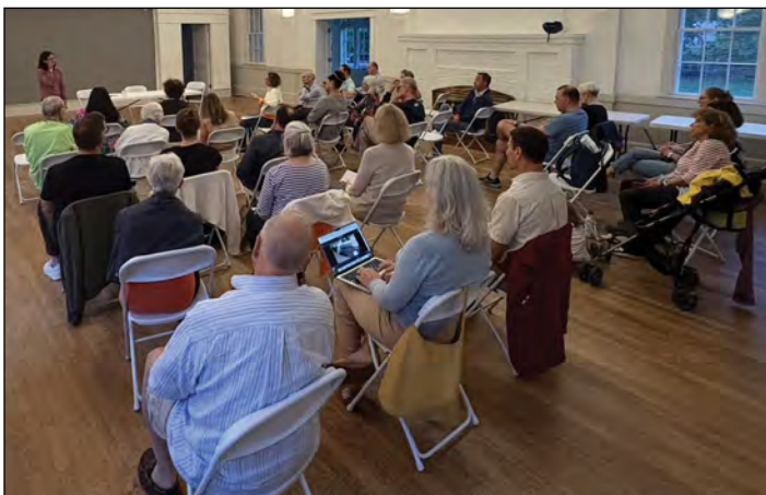
See the Lyon Park election results on page 3!

Please don't forget to mark your calendars: LPCA meetings are the second Wednesday of every month. On October 8th, at 7 p.m., LPCA is teaming up with the Ashton Heights Civic Association to sponsor a School Board candidate's night with the three candidates. We have also invited representatives from the three neighborhood School PTAs to participate. We are excited that Texas Jack's BBQ will be providing complementary appetizers for this meeting. Also come prepared to play a fun Lyon Park trivia game (with special prizes) right before the candidates speak. You will not want to miss this monthly meeting. And make sure to mark your calendars for Lyon Park's annual Halloween festivities, including the children's parade of costumes, and our magical Bonfire in the Park, on October 31st, where we will again be serving "healthy" Krispy Kreme donuts!