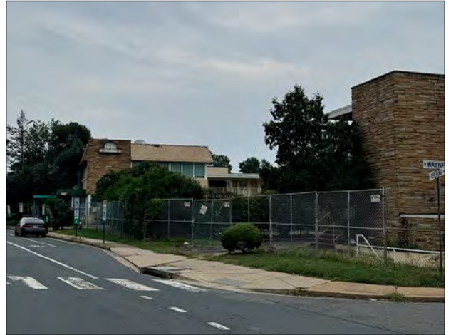
Fencing surrounding the ARVA site.

Stay informed on Arlington County development concerns: attend the October 8 LPCA meeting, starting at 7:00 p.m.