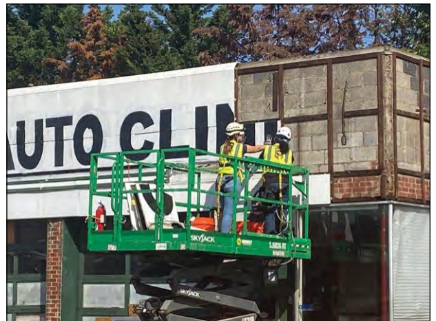
Dismantling of the Joyce Motors panels for restoration.