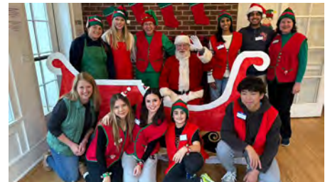
Holiday Party December 14, 2025