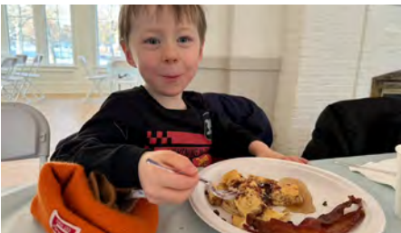
Pancake Breakfast January 24, 2026