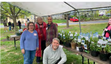
Plant Sale April 18, 2026