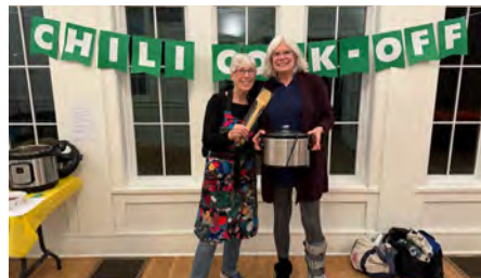
Chili Cook-Off March 15, 2026