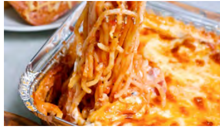
Spaghetti Dinner September 28, 2025