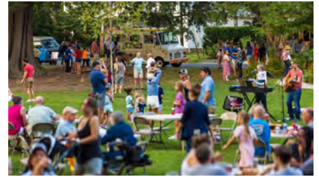
Yard Sale/Food Truck Fest September