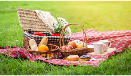
Centennial Picnic July 26, 2025