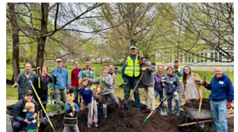
Mulch the Park April 2026