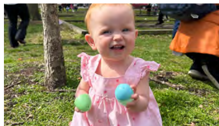
Children's Egg Hunt April 18, 2026