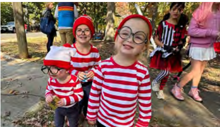
Halloween Costume Parade October 25, 2025