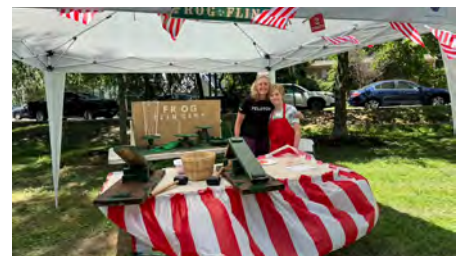
Lyon Park Spring Fair May 16, 2026

Without volunteers (like YOU!) these events may not happen. Will you step up? Contact LyonParkEvents@gmail.com to help.