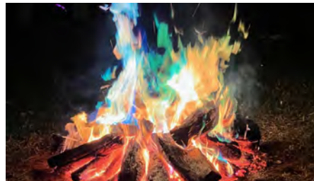
Halloween Bonfire October 31, 2025