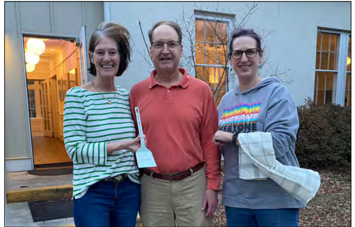
The 2025 O'Chili Cook-Off Winners! More pictures inside!

Contact me at lyonparkpresident@gmail.com .