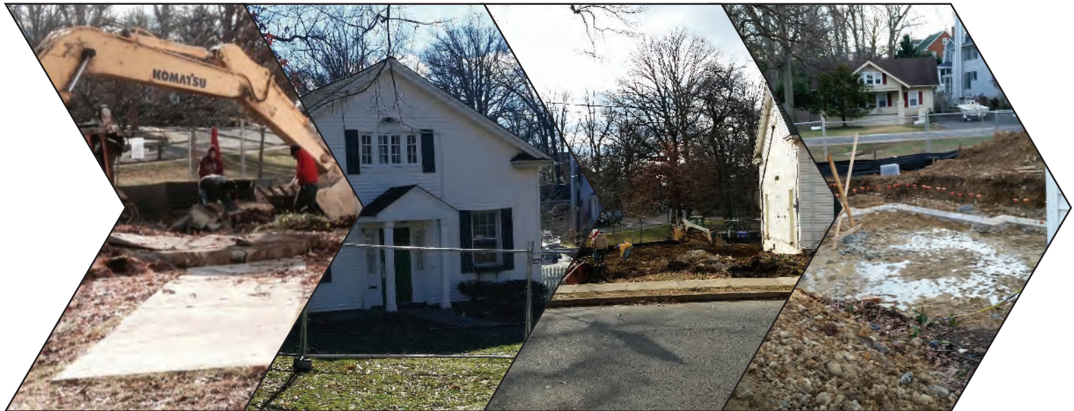
December 17, 2014 The bulldozer arrives Page 10